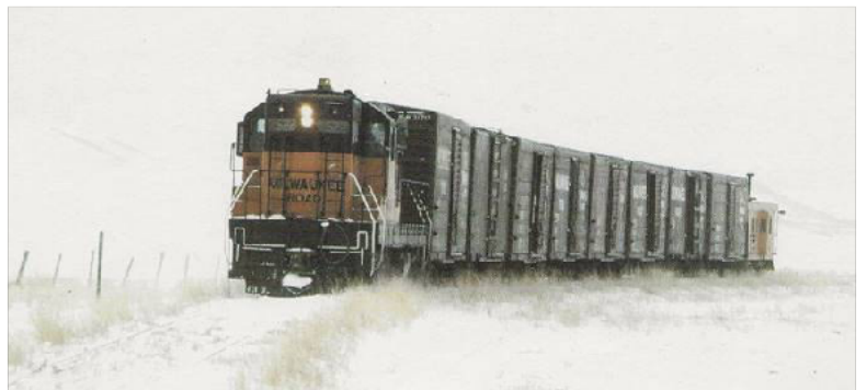
South of Winifred, MT